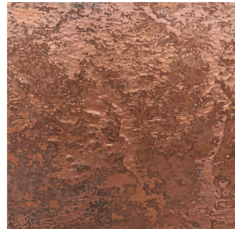
- Metal Cooper -