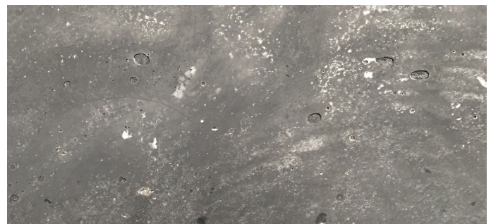
- Concrete Dark -