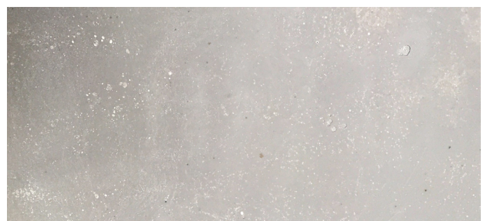
- Concrete Bright -