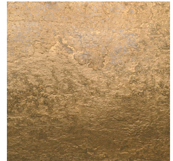
- Metal Gold -